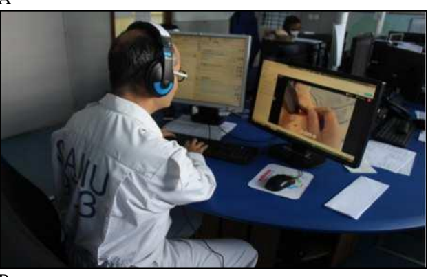
Figure 6 . (A) Medical training by elearning. (B) eLearning instructor advising the student

Hospital is frequently solicited to support foreign medical teams across neighbouring borders, telemedicine represents an obvious advantage in growing management capacity. Beyond the technical aspects, the most challenging part is still to guarantee the commitment of caregivers in its use as part of their practices. It requires a clear strategy and a solid accountable team for its setting up in the best conditions.