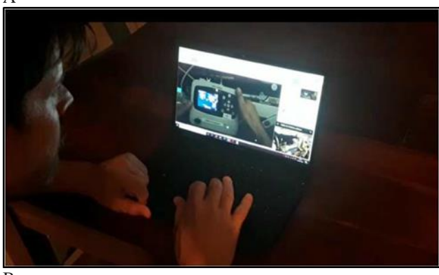
Figure 5 . (A) Care of a new born during a transatlantic medevac flight. (B) Tele-expert support during a transatlantic flight.

leader. <sup>16</sup> Similar to other low and middle-income countries, elearning may mitigate the burden of health worker shortages as well as ensuring high-quality delivery of medical education. <sup>17</sup> Indeed, the plan is to implement an internal programme that develops individual skills, takes into account the needs of practitioners in remote areas, service goals, qualifying courses for younger doctors, and the annual continuing education programme. During the COVID-19 period, regular virtual training benefited teams working in remote areas, especially for implementation of protective measures and providing periodic updates about specific treatments as knowledge evolved. (Figure 6)