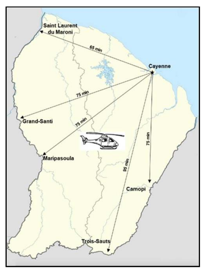
Figure 3. One trip access time to the main remote sites by

In FG, there is a lack of qualified doctors and weaknesses in the emergency care network.<sup>5</sup> The integration of advanced