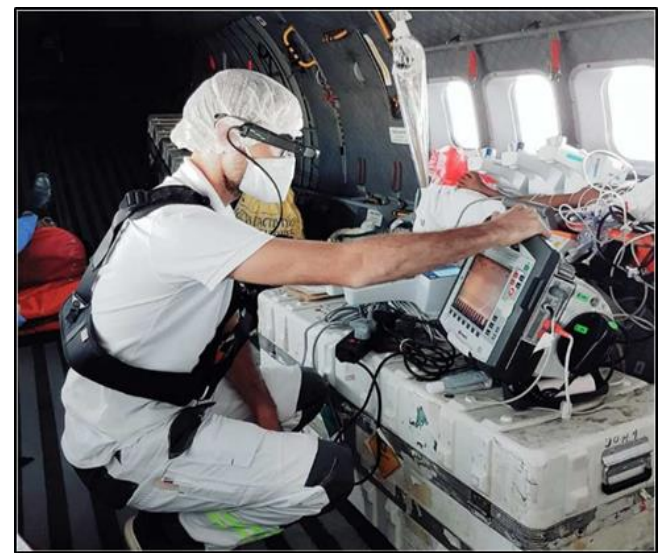
Figure 4. COVID-19 medevac by airplane with connected glasses.

According to an internal investigation in 2019, 40% of doctors working in remote areas had already faced critical situations needing mechanical ventilation, which was judged as not feasible before the arrival of the emergency doctor coming from Cayenne (Personal data). This is obviously stressful and can impair or delay the correct performance of procedures by healthcare providers. The literature shows that management of emergency situations requires good conditions at work to prevent stress and burn out.11 The telemedicine system set up includes a camera worn by the practitioner on site which allows the emergency doctor to guide them remotely and in real time, facilitating life-savings actions. (Figure 4) In our investigation, interviewed professionals declared that this kind of support makes the emergency management less anxiety-provoking for those who have to manage urgent situations without expertise, avoiding any delay in diagnosis or in carrying out the appropriate treatment.